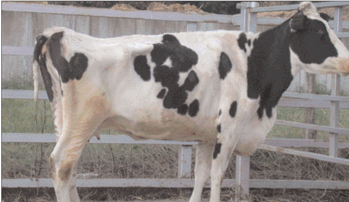
Cow with Johne's disease: emaciation, bottle jaw, diarrhoea.