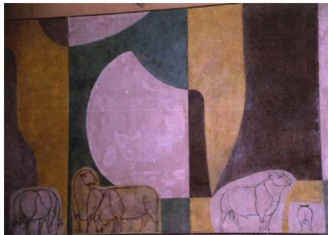
Sala Conferenze IZS LT, sede di Roma. Dipinto a muro di Enzo Rossi (anni '50)